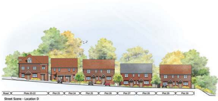
Street Scene - Location D