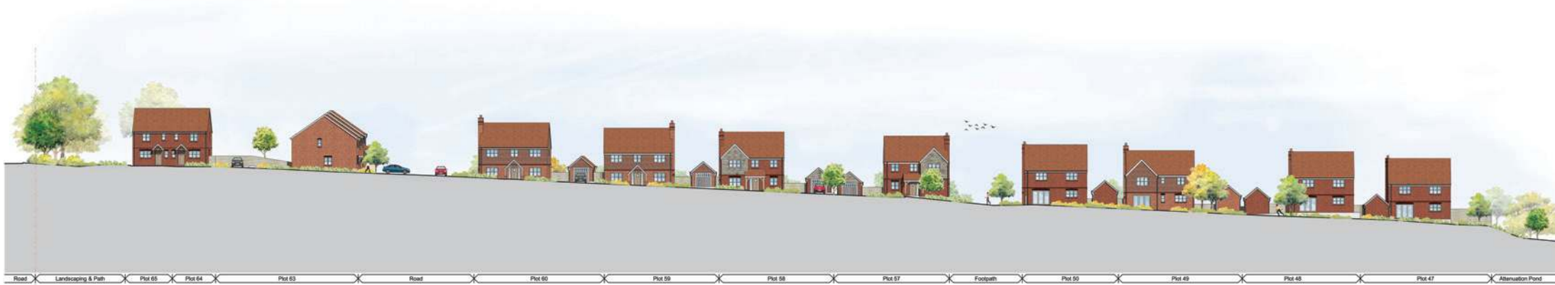
Site Section - Location E