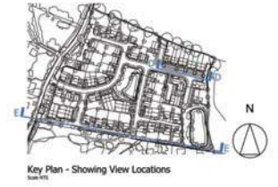
Key Plan - Showing View Locations