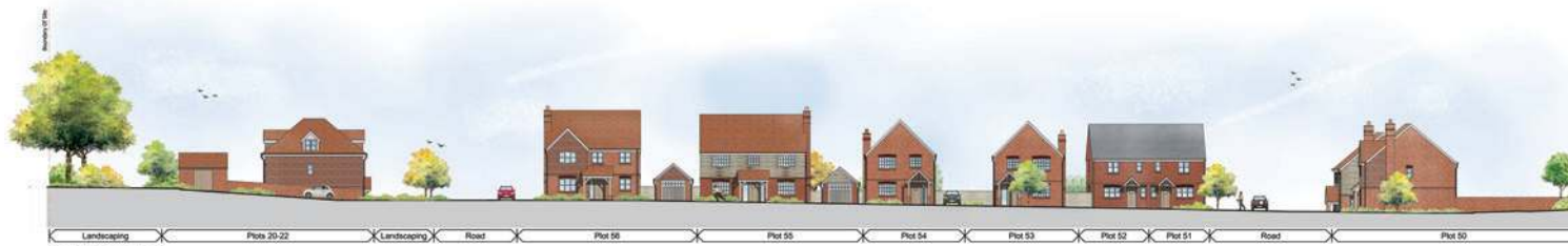
Site Section - Location B