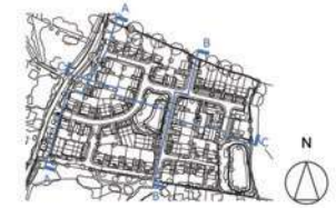
Key Plan - Showing View Locations See List